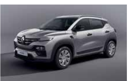
MOONLIGHT SILVER (MP)