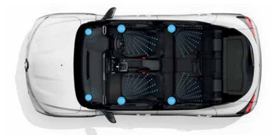
Premium Audio Sound System (4 speakers + 2 tweeters)

It features Apple CarPlay® and Android Auto™ with wireless* smart phone replication and Premium Audio Sound System for an exciting in-car entertainment experience. Smart technology inside continues in Push Start/Stop, Smart Access Card, rear view camera and Auto AC*.