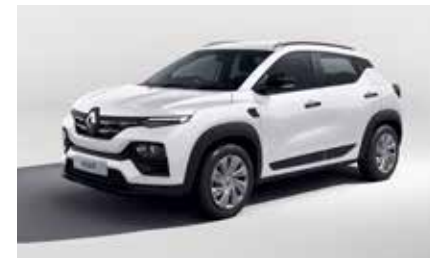
ICE COOL WHITE