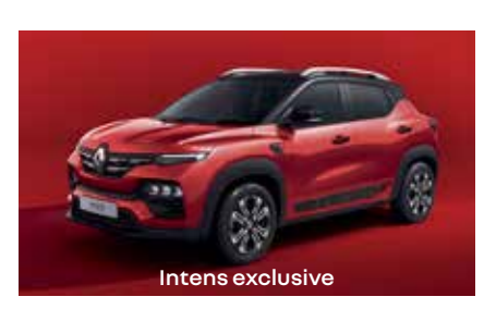
RADIANT RED (Dual Tone Mystery Black roof)